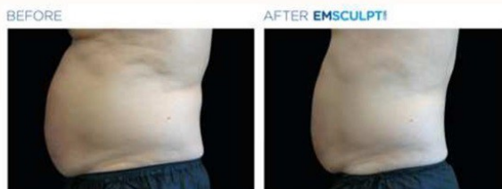
1 MONTH AFTER THE LAST TREATMENT

Seven clinical studies were completed to mark Emsculpt Neo's launch to market. These showed: